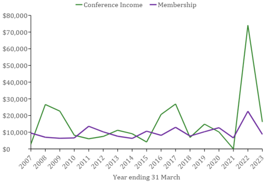
Figure A2.2: NZMSS conference surplus and membership income from 2007 to 2023.